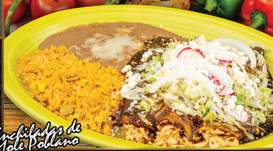
Enchiladas de Mole Poblano