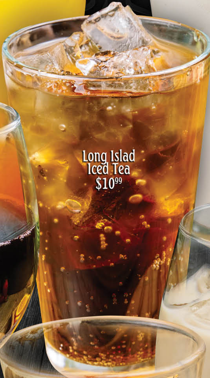
Long Island Iced Tea $10 99