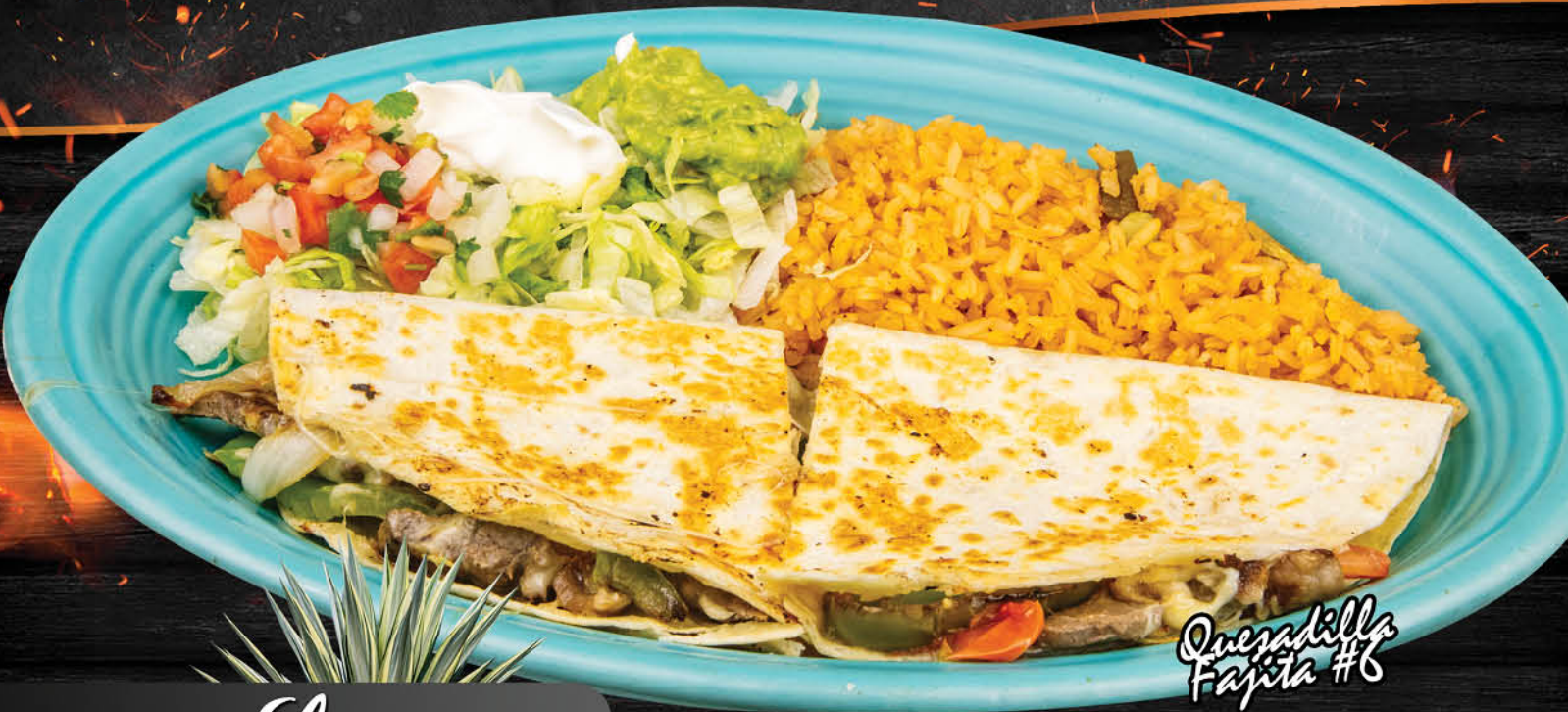
Quesadilla Fajita #6