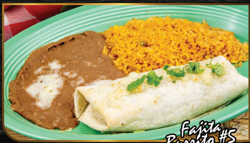
Fajita Burrito #5

*Consuming raw or undercooked meats, poultry, seafood, shellfish, or eggs, may increase your risk for foodborne illness.