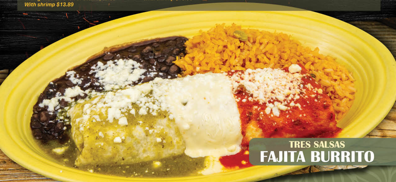
TRES SALSAS FAJITA BURRITO