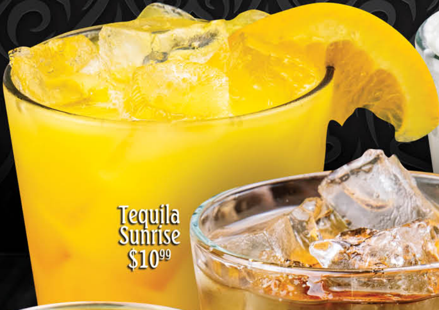
Tequila Sunrise $10 99