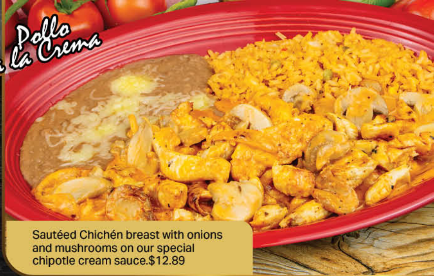
Sautéed Chichén breast with onions and mushrooms on our special chipotle cream sauce. $12.89