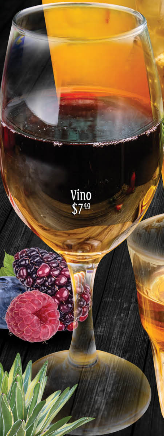
Vino $7 49