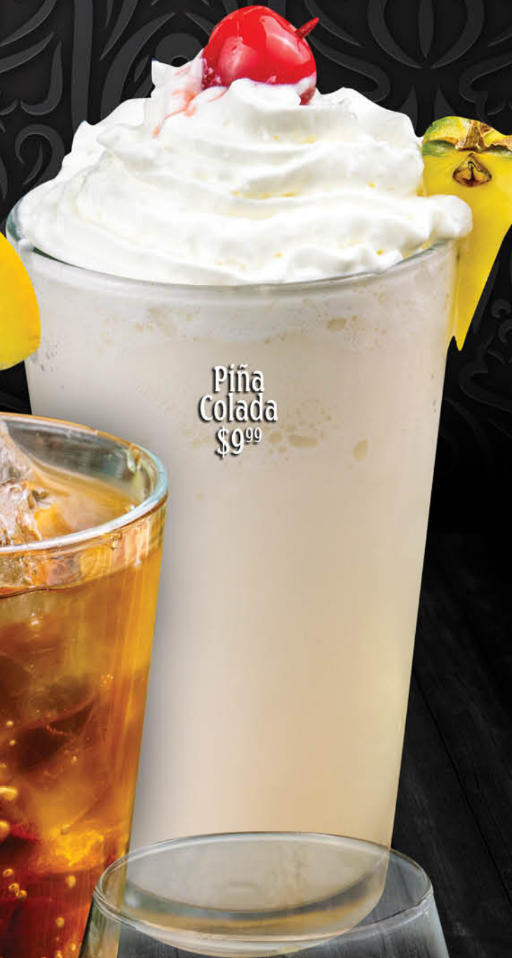
Piña Colada $9 99